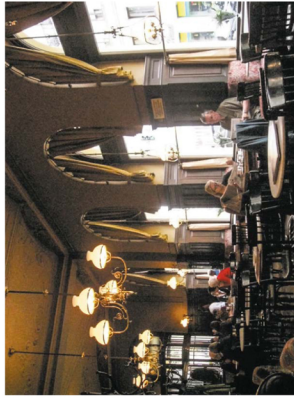
← Remains in the historic Café Sperl, one of the most popular and oldest since 1880.

Vienna is a shadowy, sooty, and sometimes colorful city. It is a city of shadows, sooty, and sometimes colorful. It is a city of shadows, sooty, and sometimes colorful. It is a city of shadows, sooty, and sometimes colorful.