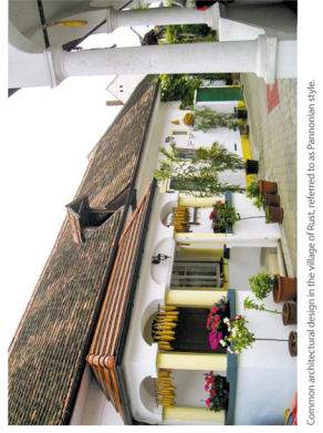
Common architectural design in the village of Raasdorf, referred to as 'Pramenian style'.