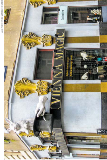
← The Vienna Magic store on Mariahilferstrasse.

at the end of the stalks are the restaurants. One of the high spots, literally, is the Giant Ferris Wheel, a gripping locale in the Prater amusement park. It is one of Europe's largest.