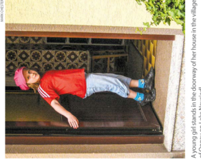
A young girl stands in the doorway of her house in the village of Oggau on Lake Neusiedler.