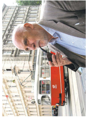
← A smartphone user on the train in Vienna, with a view of the Ring.

For more information on Vienna: www.viennatourism.com www.zeitung.at www.2020.at